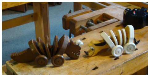
Year 8 projects

generator. The rather cheerful looking toys of the year 8 project ( 3rd form) are certainly more interesting than the teapot stands we made at that age. In my case an especially bad teapot stand.